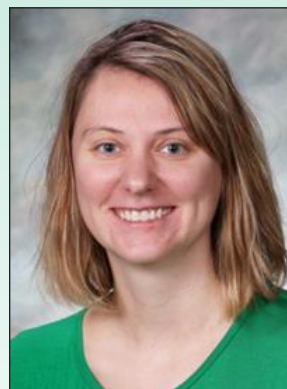
High School Sam Davis Lafayette High School St. Joseph